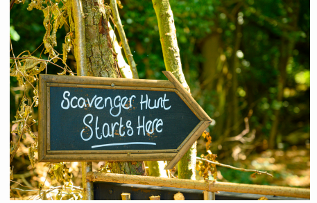
cooking scavenger hunt